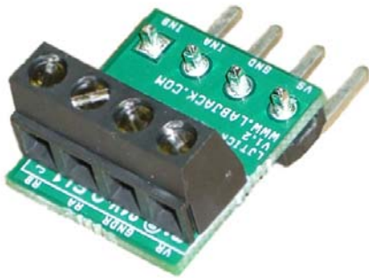
Figure 1: LJTick-RelayDriver (LJTRD)

The pictures below show the LJTRD by itself and plugged in to a LabJack.